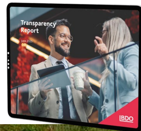
BDO IRELAND TRANSPARENCY REPORT